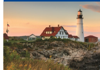
See the Portland Head Lighthouse

Departure: 50 North, 339 E Melrose Ave, Findlay, OH @ 8 am