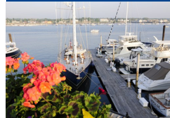
Enjoy the historic Portland Waterfront