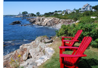
Explore quaint Kennebunkport